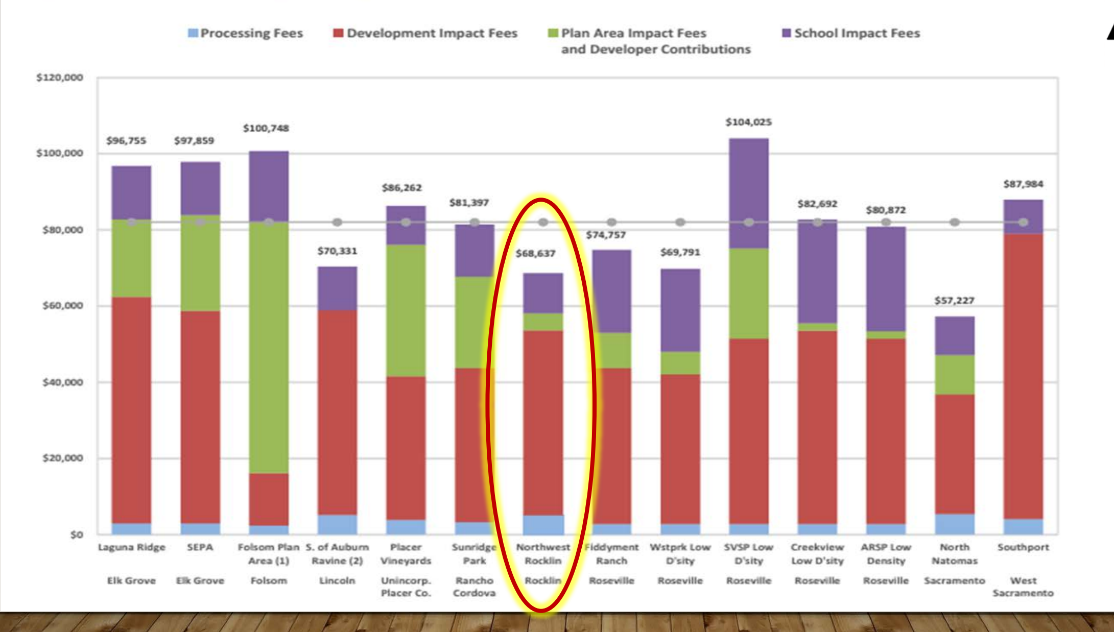
Figure S1 - Cumulative Single Family Residential Exactions by Jurisdiction (Per-Unit)