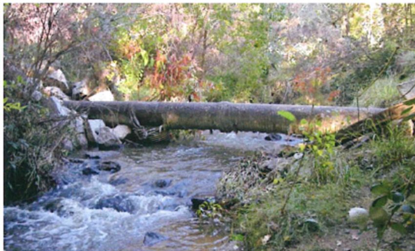
J07-058: Looking upstream at crossing