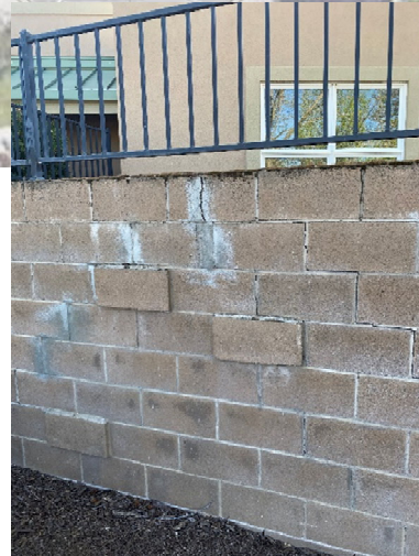
Cracks in the wall.