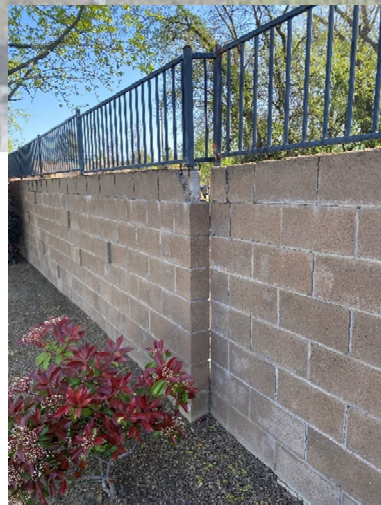
Damaged block/wall separation.